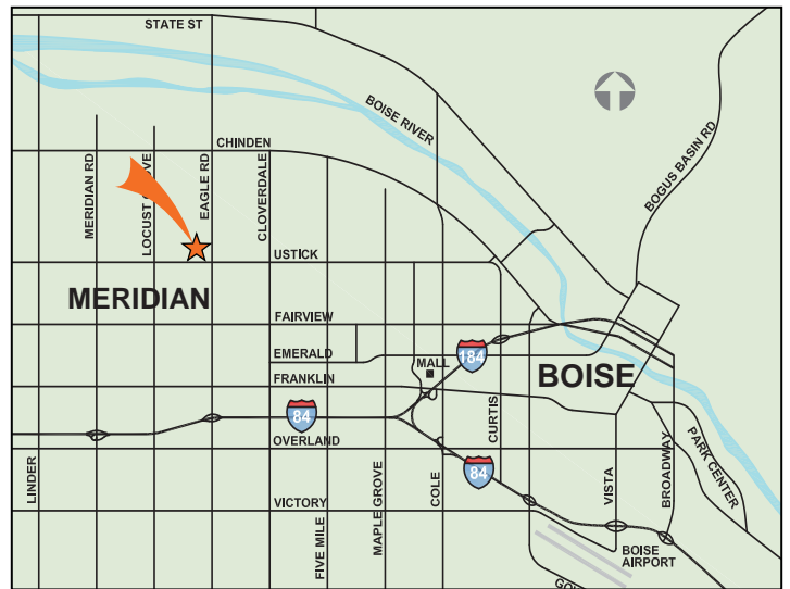
★ Property Location - 3327 N Eagle Rd, Meridian